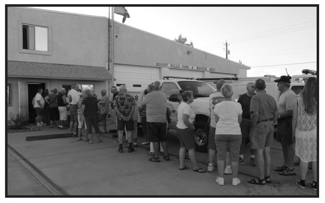
LONG LINES to get the best Spaghetti Dinner in town!

result has made a better layout for the functions as well as provide space for two refrigerators for the firefighters.