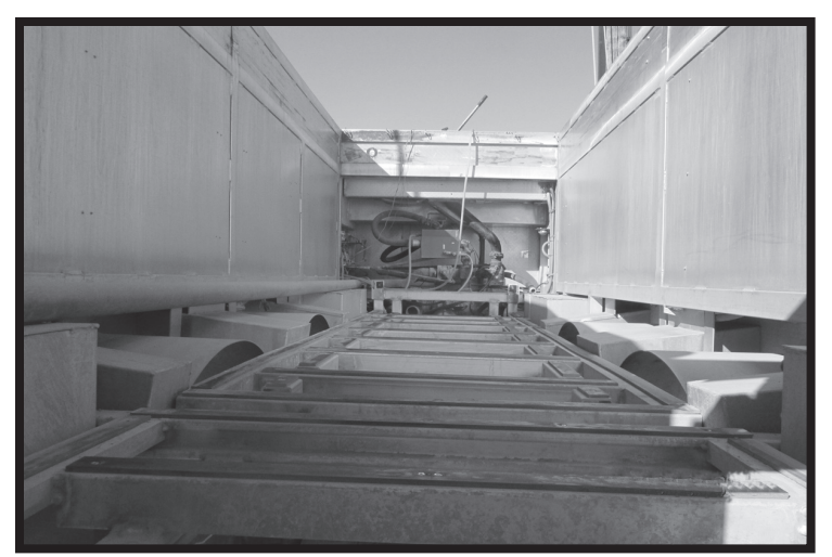
What the inside of a fire engine looks like without the tank.

With the start of Spring we would like to remind everyone with the rising temperatures heat related illness is a big concern for our community. People who stay in doors should