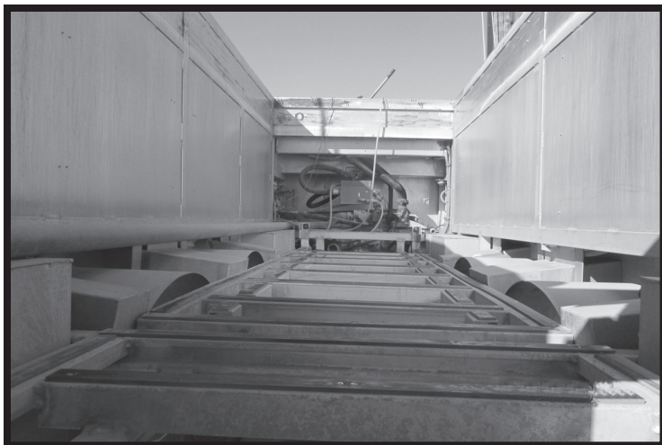
What the inside of a fire engine looks like without the tank.

With the start of Spring we would like to remind everyone with the rising temperatures heat related illness is a big concern for our community. People who stay in doors should