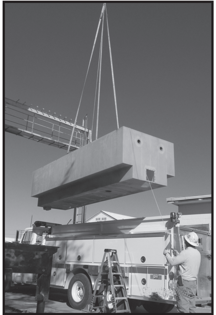
Setting back the welded water tank.

DHFD is happy to report that we sent 4 firefighters to Prescott for the Annual AZ Wildfire Academy in March.